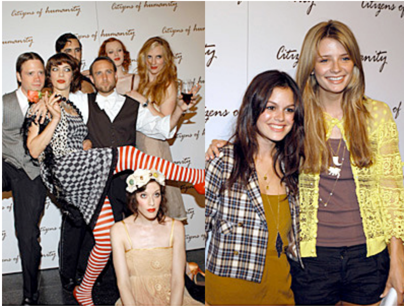
The Citizens Band