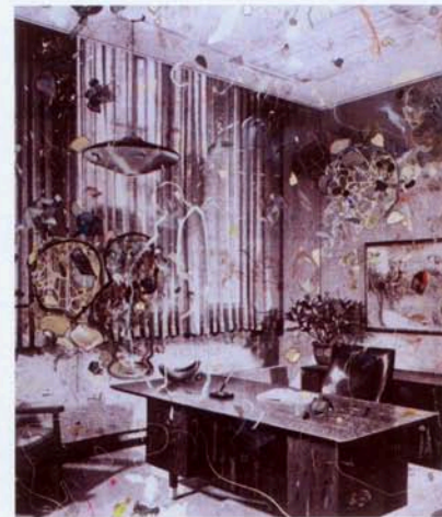
Carter, 1955, 1978, 1981, Area , 2009, digitally altered, folded, and defaced laser prints, acrylic ink, paint, and gel on paper and canvas, 86 x 72".

What appear to be film sets or old-fashioned interiors (think 1940s and '50s modern with Rococo furnishings) form digitally altered and collaged photographic backgrounds for And Within Area Although #1 and And Within Area Although #2 (all works 2009), upon which Carter builds intricately worked surfaces. These and other works, including the Mad Men -ish office in 1955, 1978, 1981, Area and the images self-consciously engaging sculpture—e.g., Item Placed in Area (Unfolding Abstract Modern Sculpture) and 1942, 1955, 1977, 2009, Portrait of a Thoughtful Abstraction with Arranged Interior and Modern Sculpture , which both feature a generic, corporate office